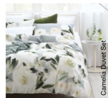
Camelia Duvet Set