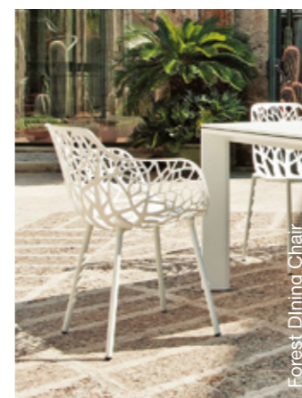
Forest Dining Chair