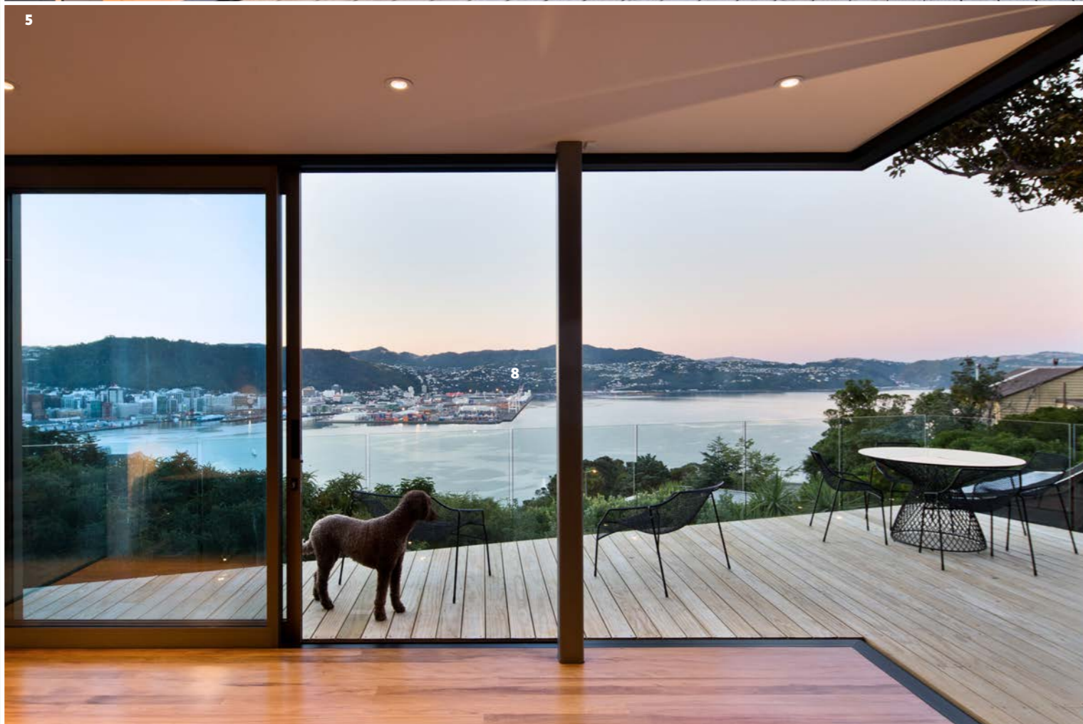
4. The perfect spot to wind down after a busy day in the Capital 5. The large windows mean the homeowners can enjoy the view all year round